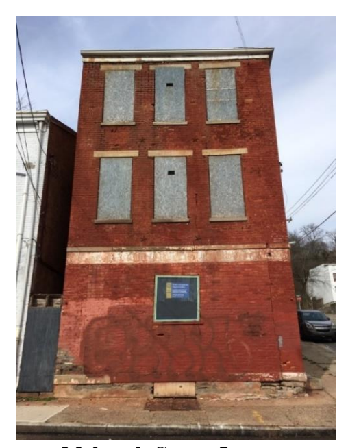
254\ Mohawk\ Street\ Images