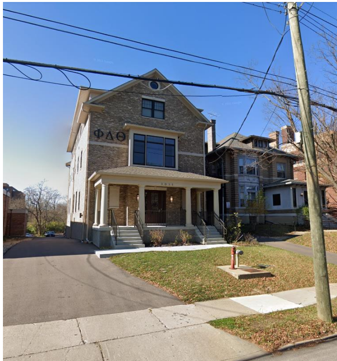
3035 Clifton Avenue