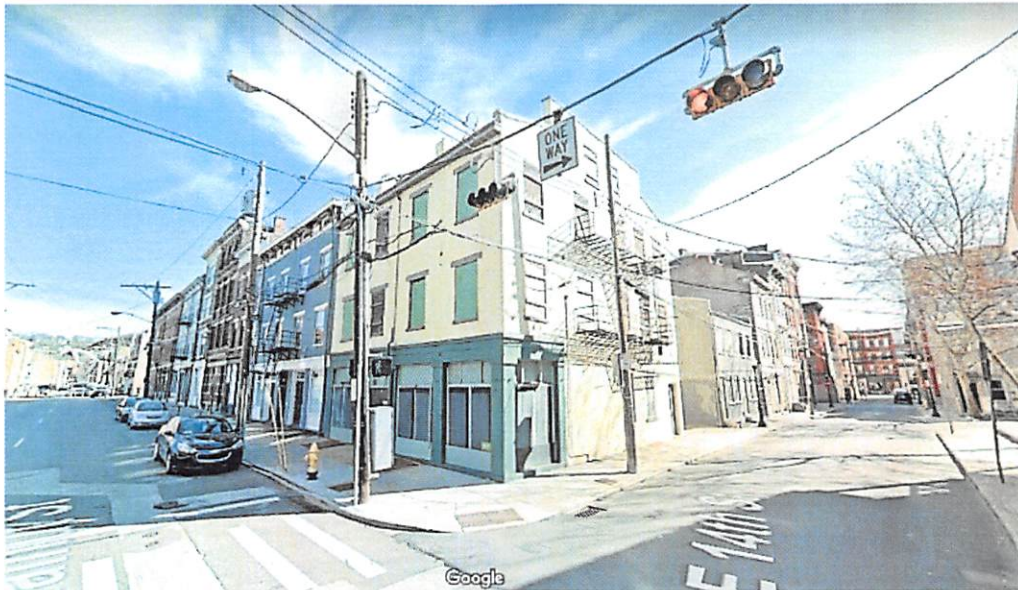
1400 Walnut Street