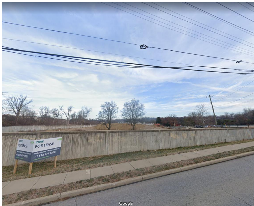
4710 Maidson Road Picture