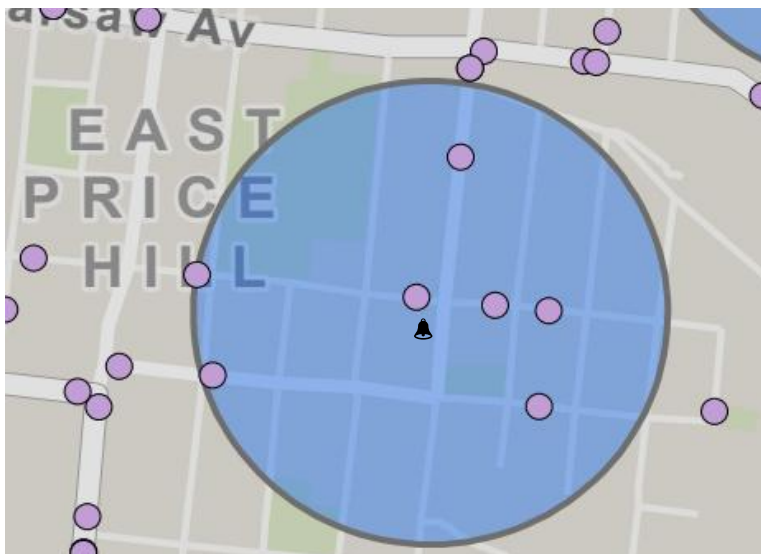
Figure 1. Example Buffer Area Around School

This circular buffer area is more likely to include adjacent streets that children may be using to walk or bike to school. As an example, Figure 1 shows a 1,000ft buffer area around Holy Family School in East Price Hill. The purple dots are traffic crashes that occurred between 2023 and 2025.