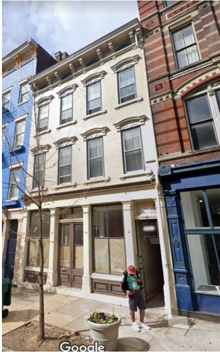
1409 Main Street