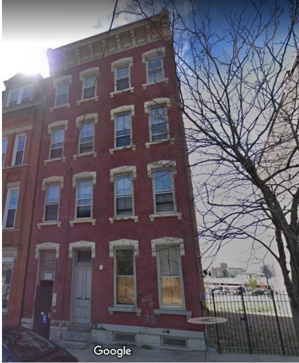
555 E 13 th Street