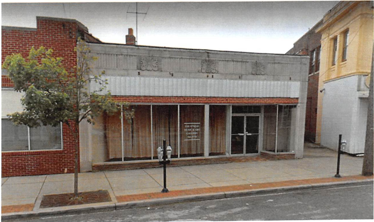
5920 Hamilton Avenue