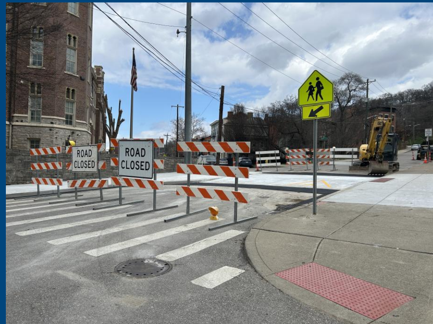
Raised Crosswalk, Rothenberg Academy, OTR

However, less than 30% of drivers exceeded 30mph, and less than 2% of drivers exceeded 40mph.