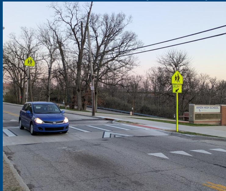
Raised Crosswalk, Aiken High School, College Hill