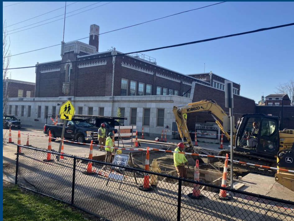
Raised Crosswalk, Oyler School, Lower Price Hill

The speed limit during school arrival and dismissal times is 20mph; outside of arrival and dismissal hours the speed limit ranges from 25 to 35, depending on location.