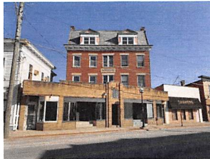
5910 Hamilton Avenue (Ruth Ellen Flats)