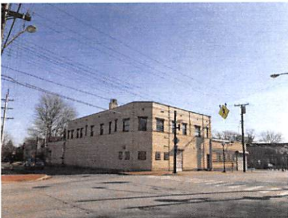
6060 Hamilton Avenue (Mergard Lanes)