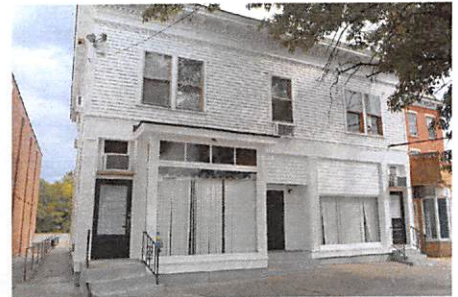
5904 Hamilton Avenue (Nameless White Building)