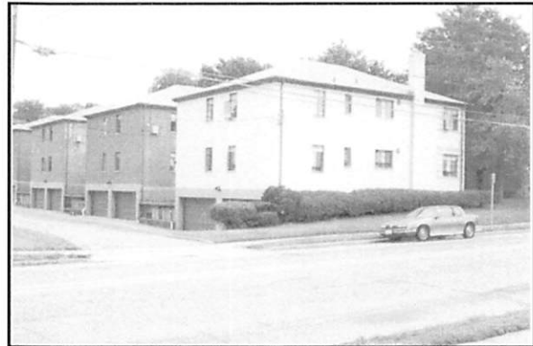
Figure 1405-03-A, B