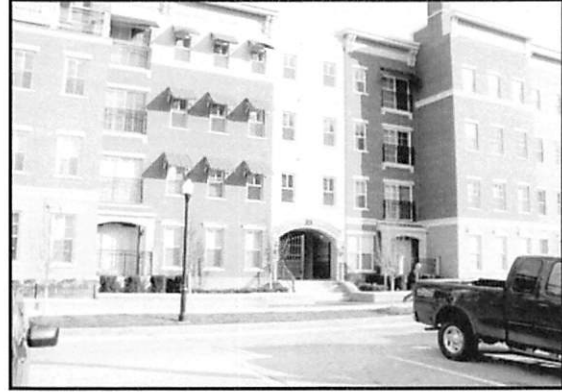
Figure 1405-03-C, D

Section 2. That existing Section 1405-03, “Specific Purposes of Multi-Family Subdistricts,” of the Cincinnati Municipal Code is hereby repealed.