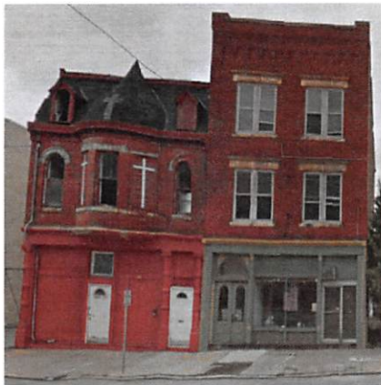
2113-2115 W 8th Street