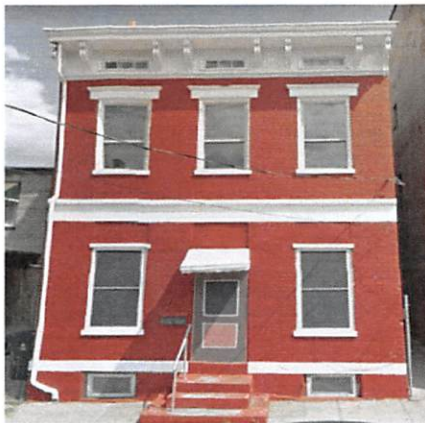
2130 St. Michael Street