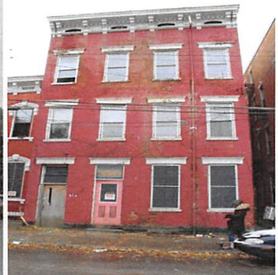
2131 St. Michael Street