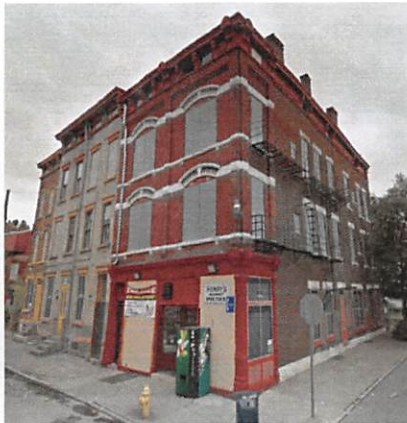
642-646 Neave Street