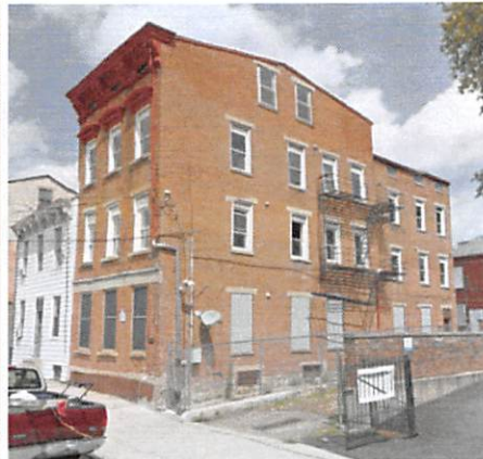
2122 St. Michael Street