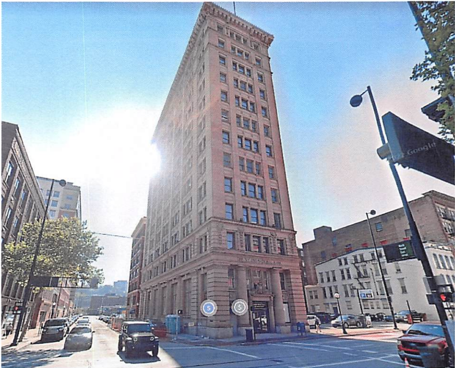
830 Main Street Picture