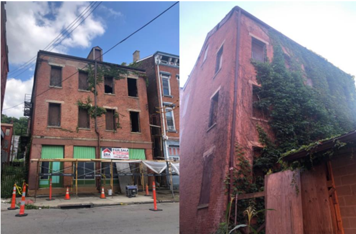
60 E McMicken Avenue