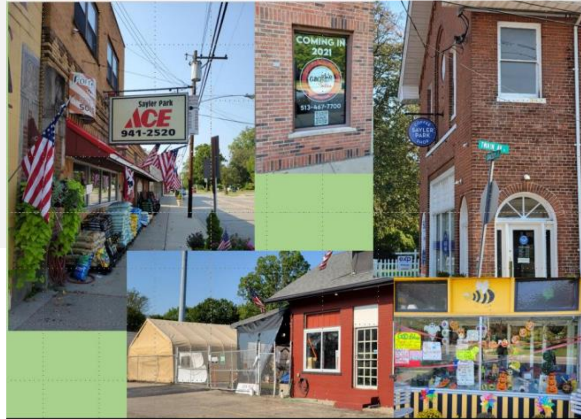
Scenes of the Sayler Park business district (Clockwise from upper left: Ace Hardware, future Angelo's Pizza place, Sayler Park Coffee Shop, Bizy Bee Bakery, annex to hardware store).