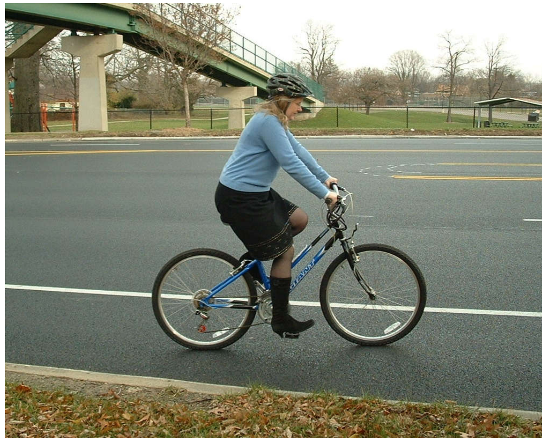
Dana Avenue Bike Lane