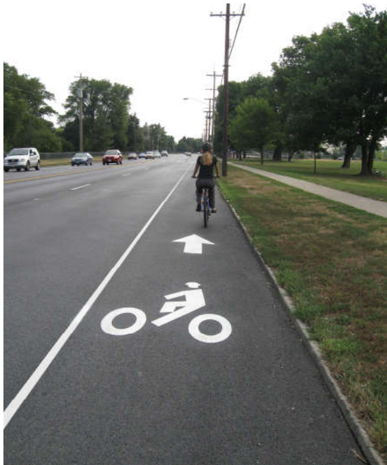
Spring Grove Ave