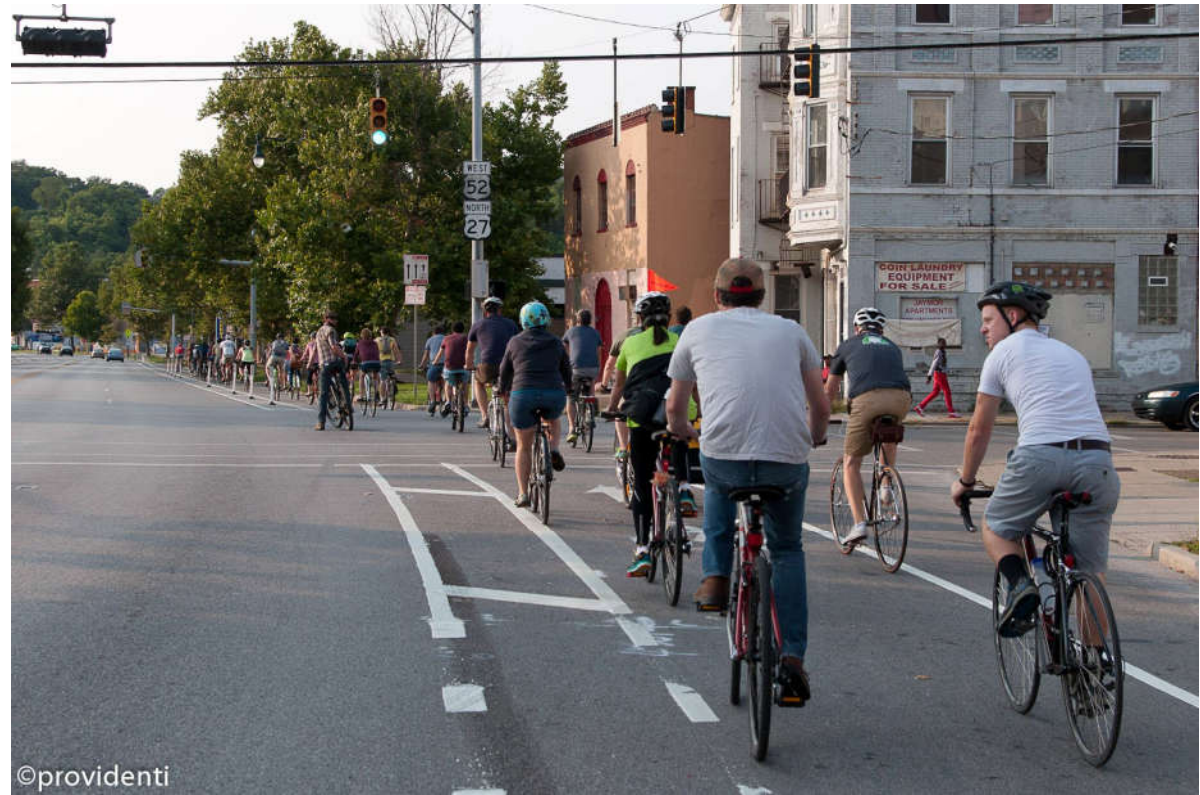
Central Parkway Protected Bike Lane