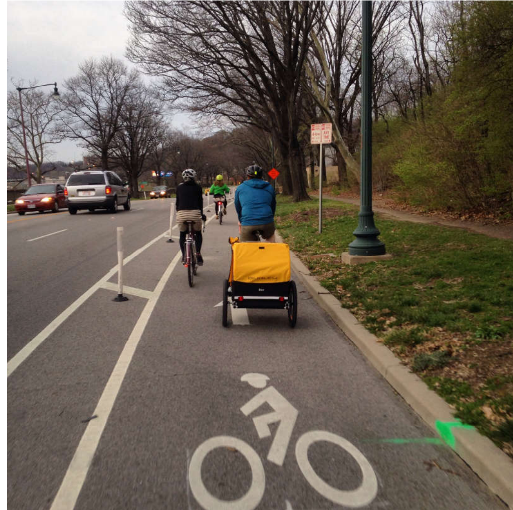
Central Parkway Protected Bike Lane