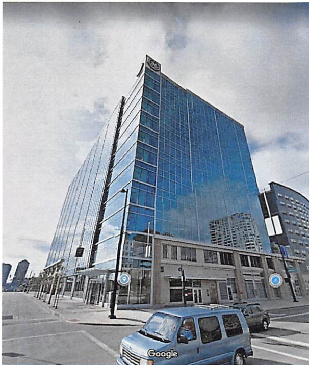
191 Rosa Parks Street