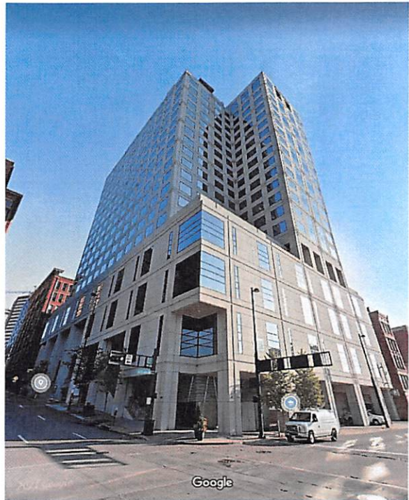
312 Elm Street