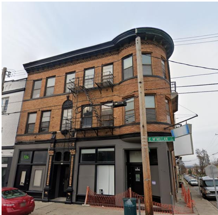
726 E. McMillan Street