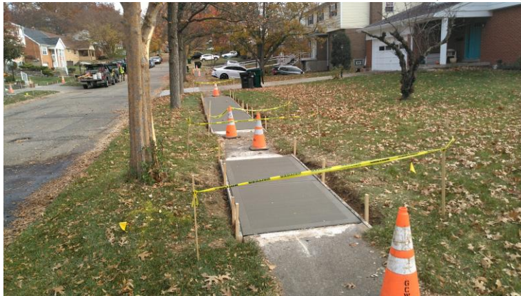
Harrywood Ct, Mt. Airy