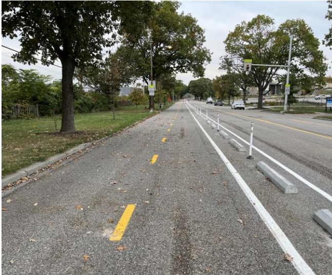
Central Parkway Phase 2