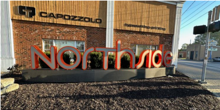
Ludlow and Spring Grove, Northside