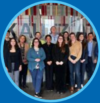
External Advisory Board for Sustainable Business