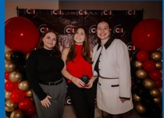
Community Impact Award (SAB) (2024-2025)