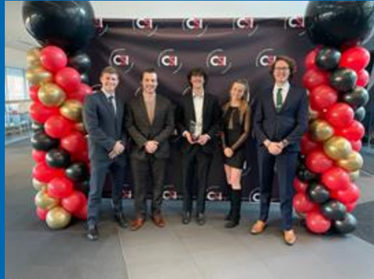
Rookie of the Year (SAB) (2022-2023)