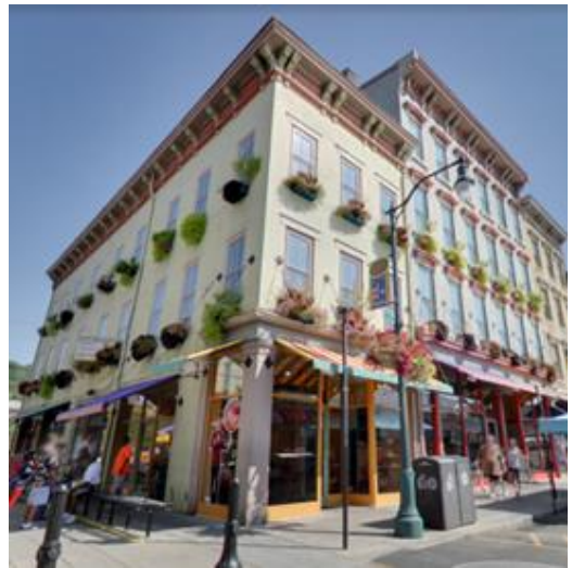
1720 Elm Street, 118 Findlay Street, 114-116 W. Elder Street