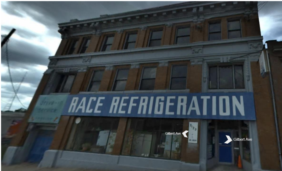
2429 Gilbert - Rehab