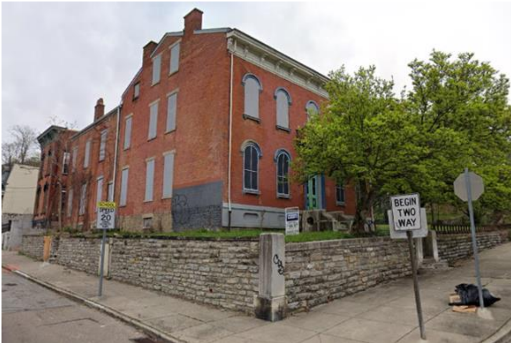
18 Mulberry Street