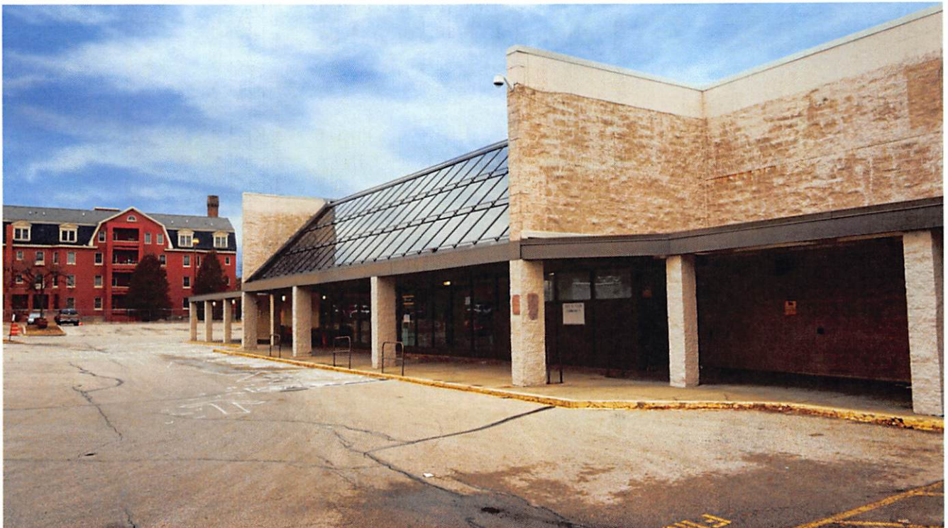
954 E McMillan – New Construction