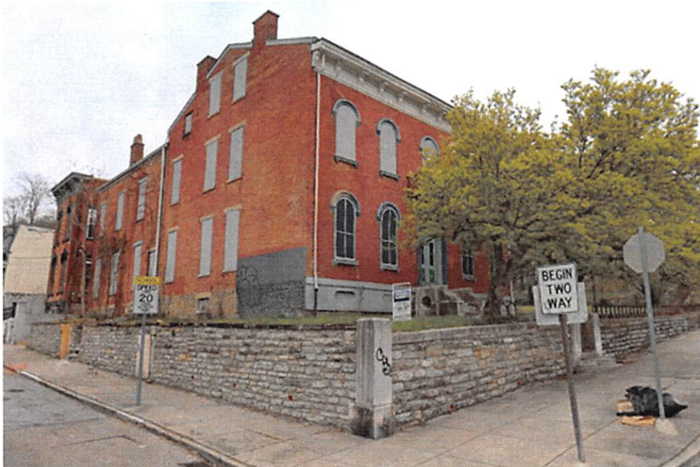
18 Mulberry Street