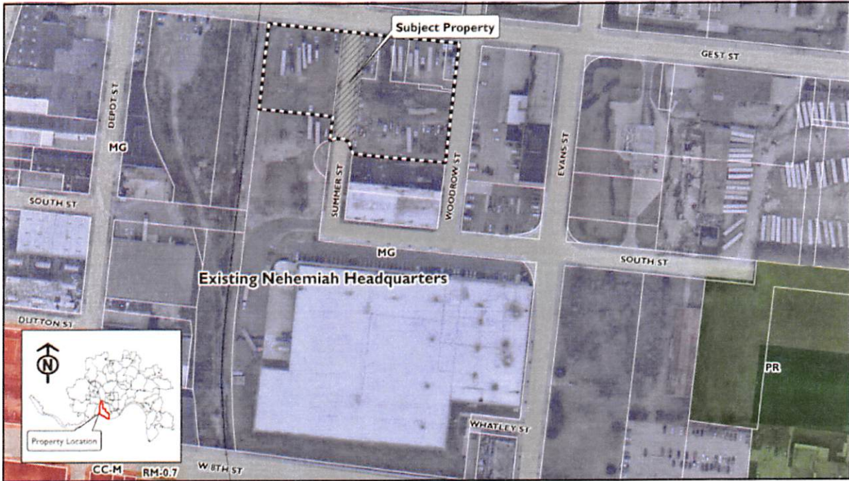
Property Location - 1917-1933 Gest Street.