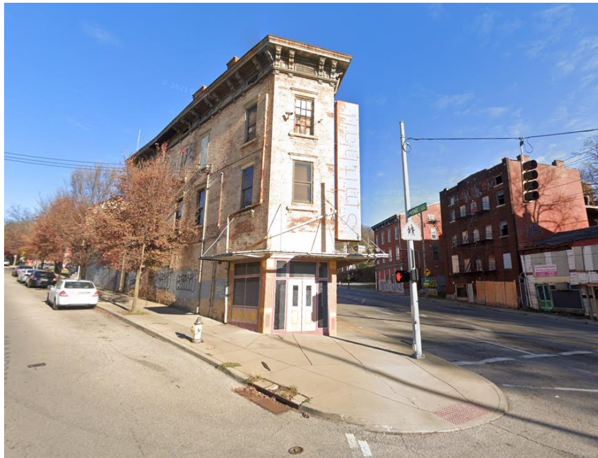
2001 Vine Street