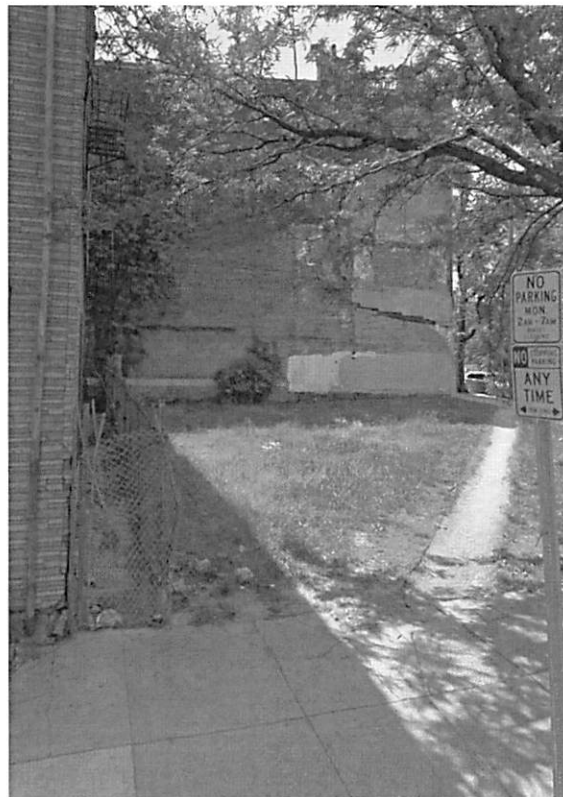
127 Green Street (the parcel is one-third of this lot)