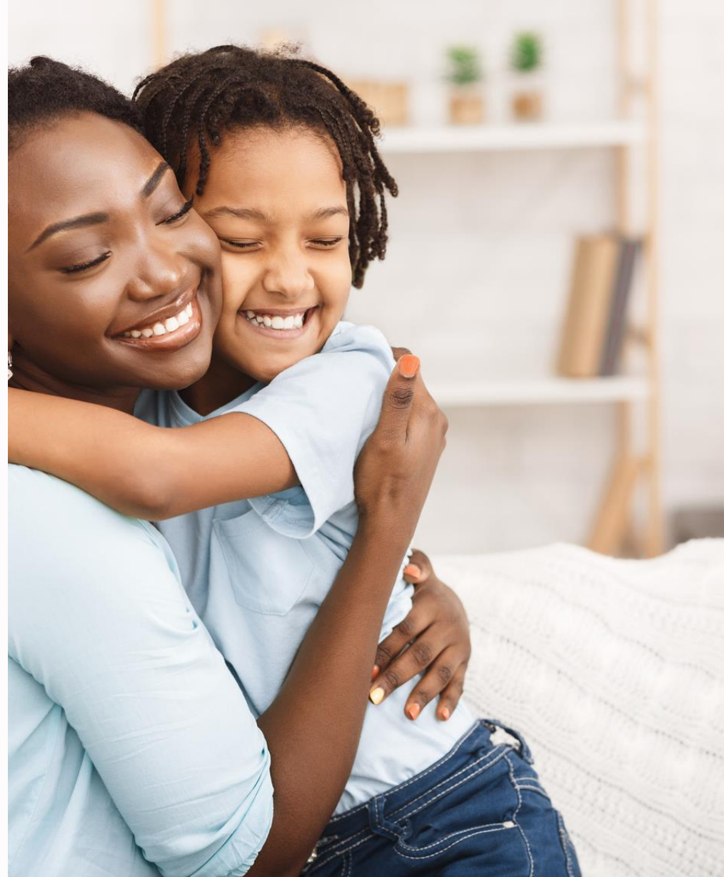
BUILDING COMMUNITY AND EMPOWERING FAMILIES