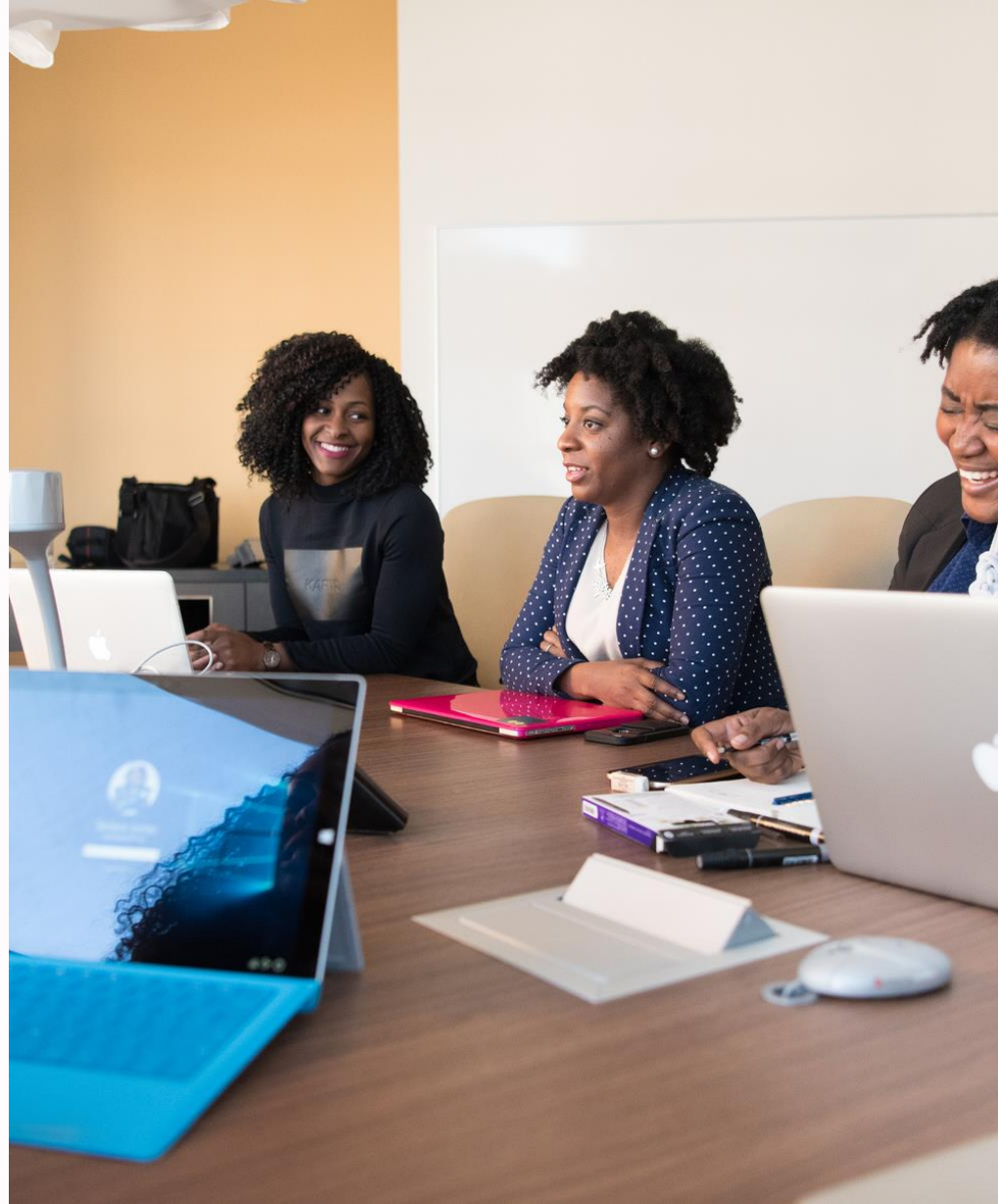
RESEARCH AND EDUCATION