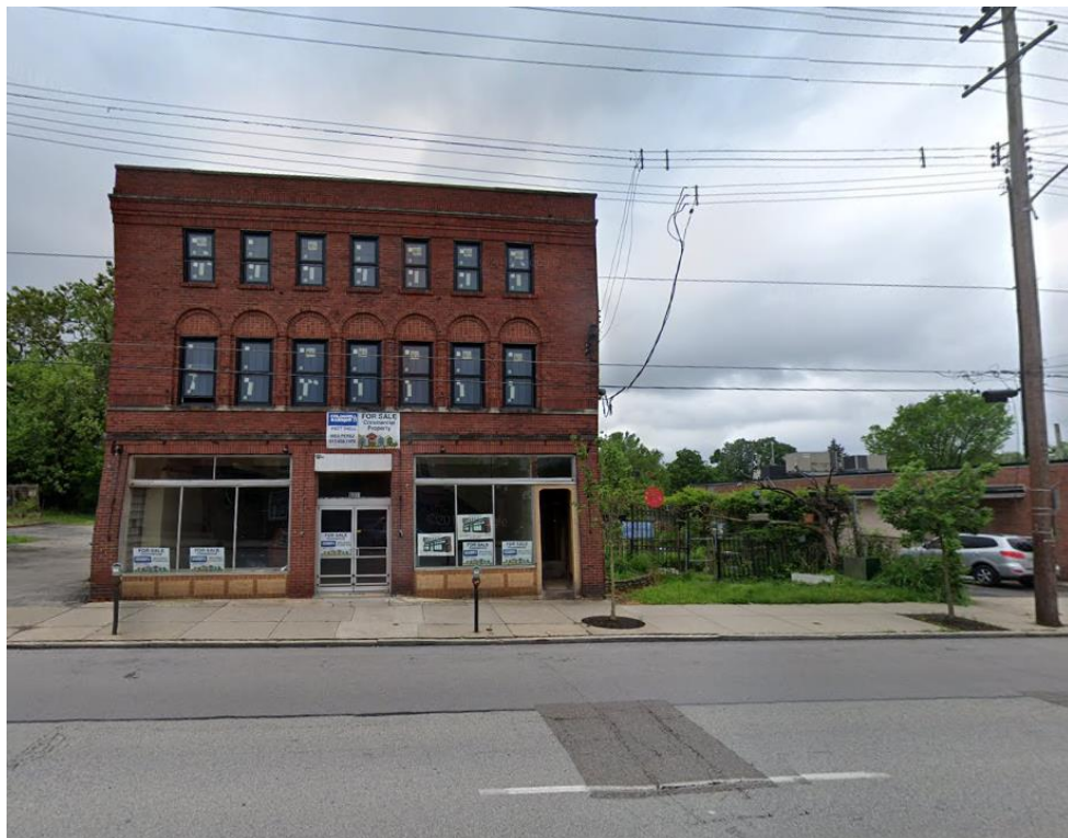
6007 and 6011 Madison Rd.