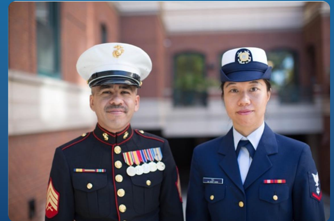
Veterans & Their Spouses