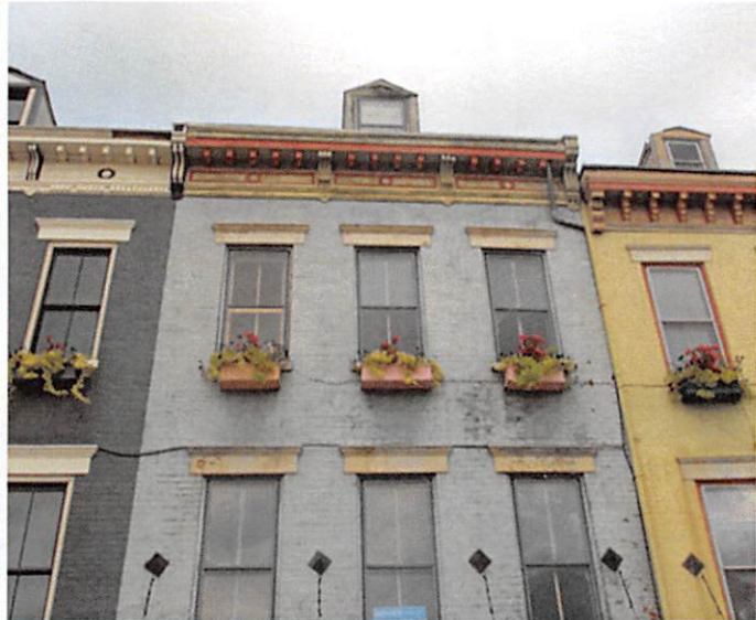
120 W. Elder Street