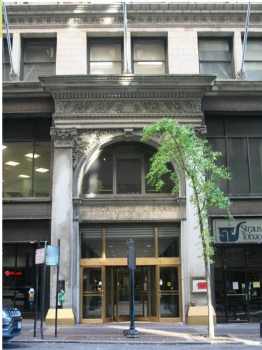
Mercantile Library Building, 414 Walnut Street, main entrance