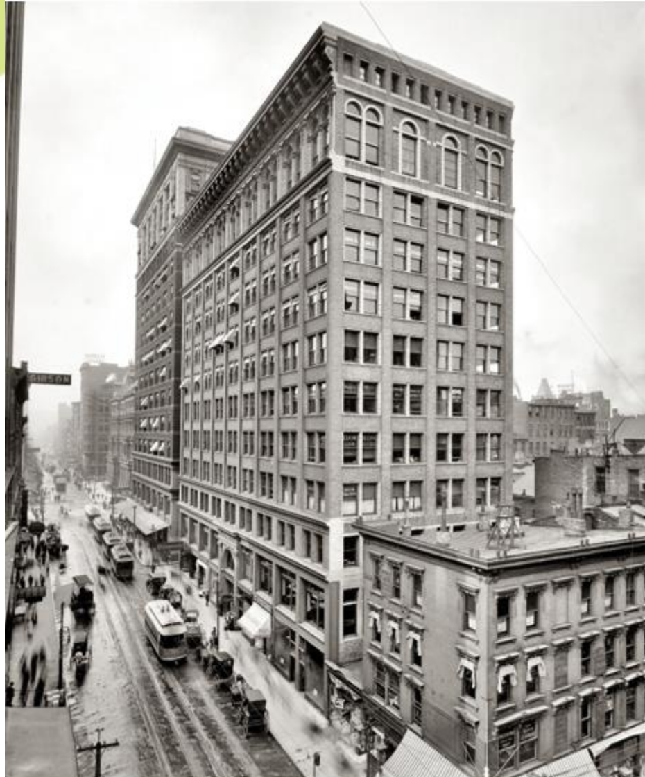
Figure 2. Historic photo of Mercantile Library Building, circa 1910