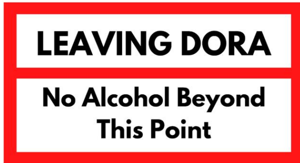
Sidewalk Tattoo Example