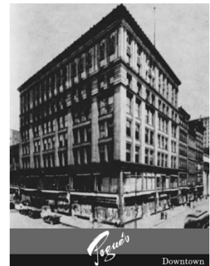
H. & S. Pogue Store at 4 th & Race