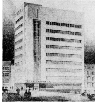
Building Rendering from 1946

The H. & S. Pogue Service Building meets Criterion 1 with its association with one of Cincinnati's most prominent department stores, H. & S. Pogue.