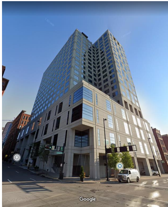
312 Elm Street