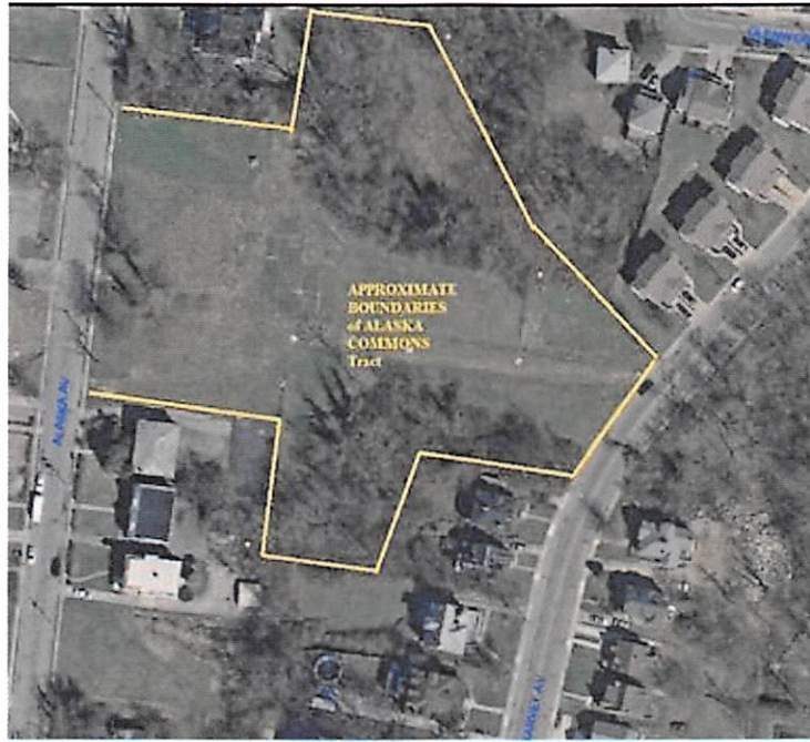
Property Location and Photograph

EXISTING PROXIMITY PARCELS: 1130022048, 1130022055, 1130022062, 1130022074 1.75 ACRES TOTAL AREA BY DUE 0.11 ACRES IN HILLSIDE OVERLAY 0.80 ACRES IN RIGHT OF WAY 2.88 ACRES IN LOTS 0.54 ACRES IN OPEN SPACE 14 CONVEYING UNITS 8.7 CONVEYING UNITS PER ACRE MIN LOT AREA = 2,000 S.F. MIN LOT WIDTH = 20' MIN FRONT YARD = 20' MIN REAR YARD = 10' 0.94 ACRES BUILDING AREA 0.16 ACRES DRIVEWAY AREA