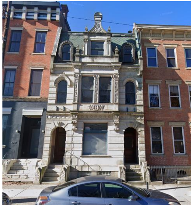
1209 Elm Street