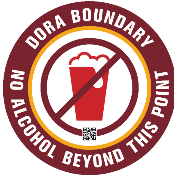
Proposed Sidewalk Tattoo