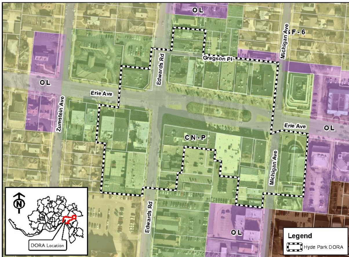
Hyde Park DORA

Attached as Exhibit C is a letter from Cincinnati's Department of City Planning confirming that the uses of land within the DORA are permitted and in accordance with Cincinnati's master zoning plan.