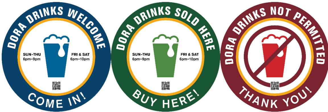
Proposed DORA Window Clings