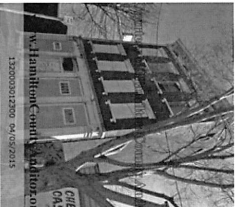
1904 Linn Street