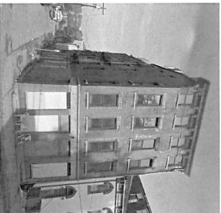
2011 Colerain Avenue