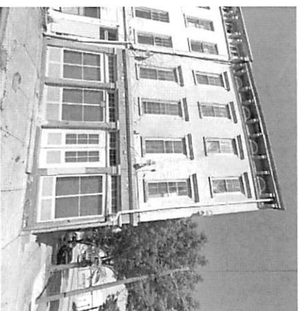
2025 Colerain Avenue