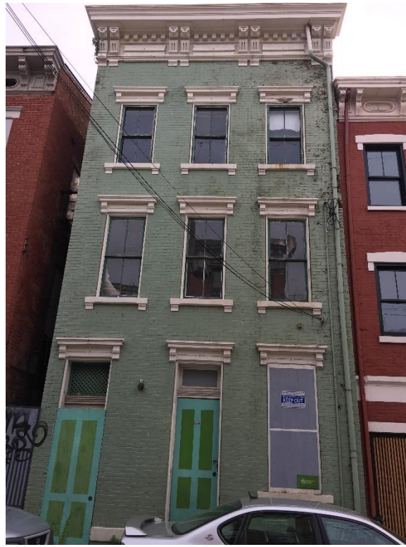
1623 Pleasant Street