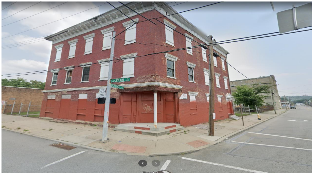
4000 & 4004 Colerain Avenue, Project Photo