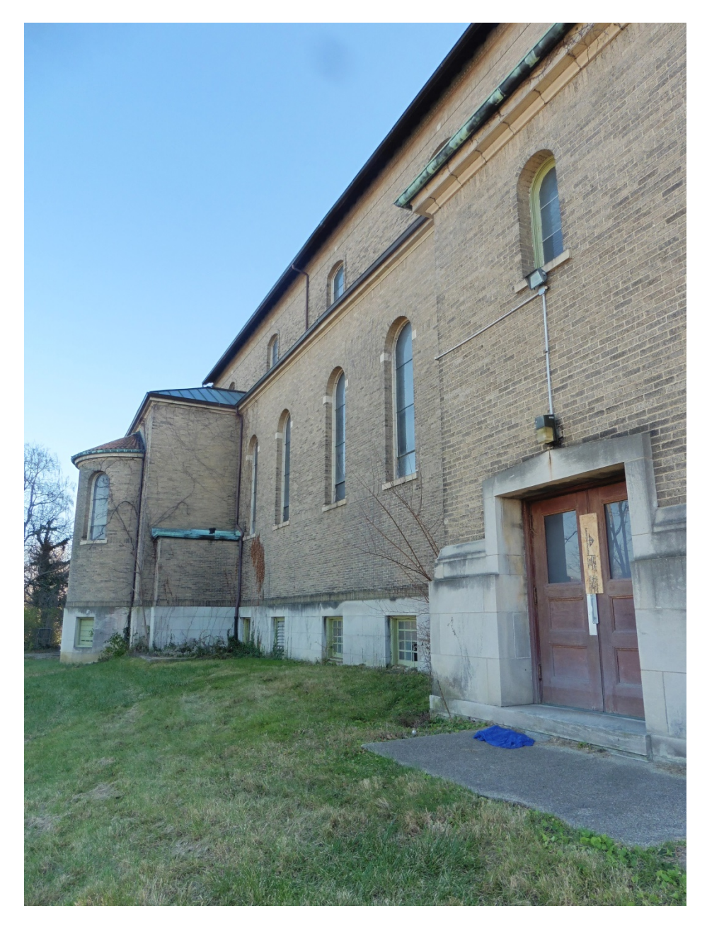
Figure 4 View of north elevation of church building, from the southeast.