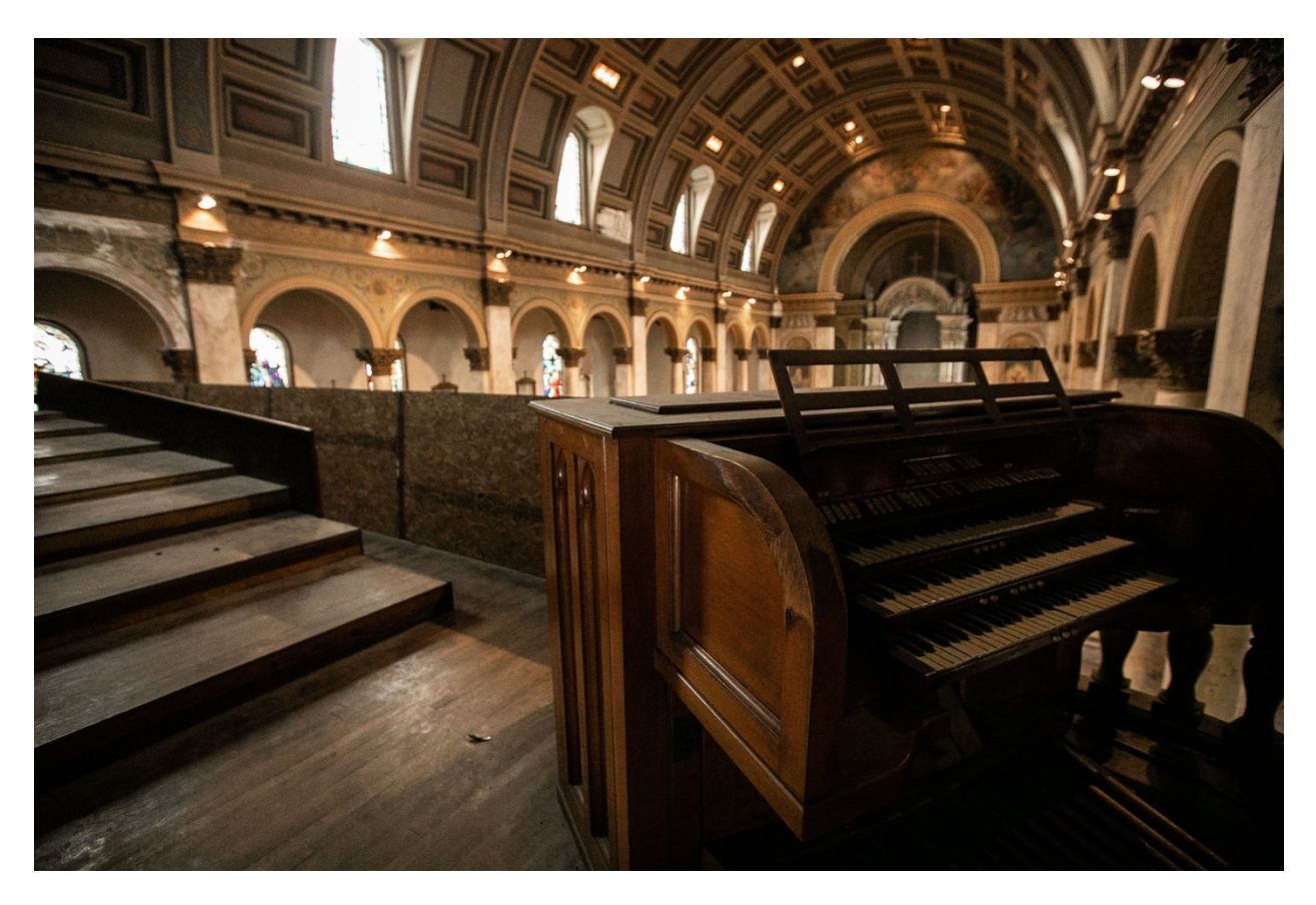
Figure 6 View of interior of church from choir loft, with organ in foreground.