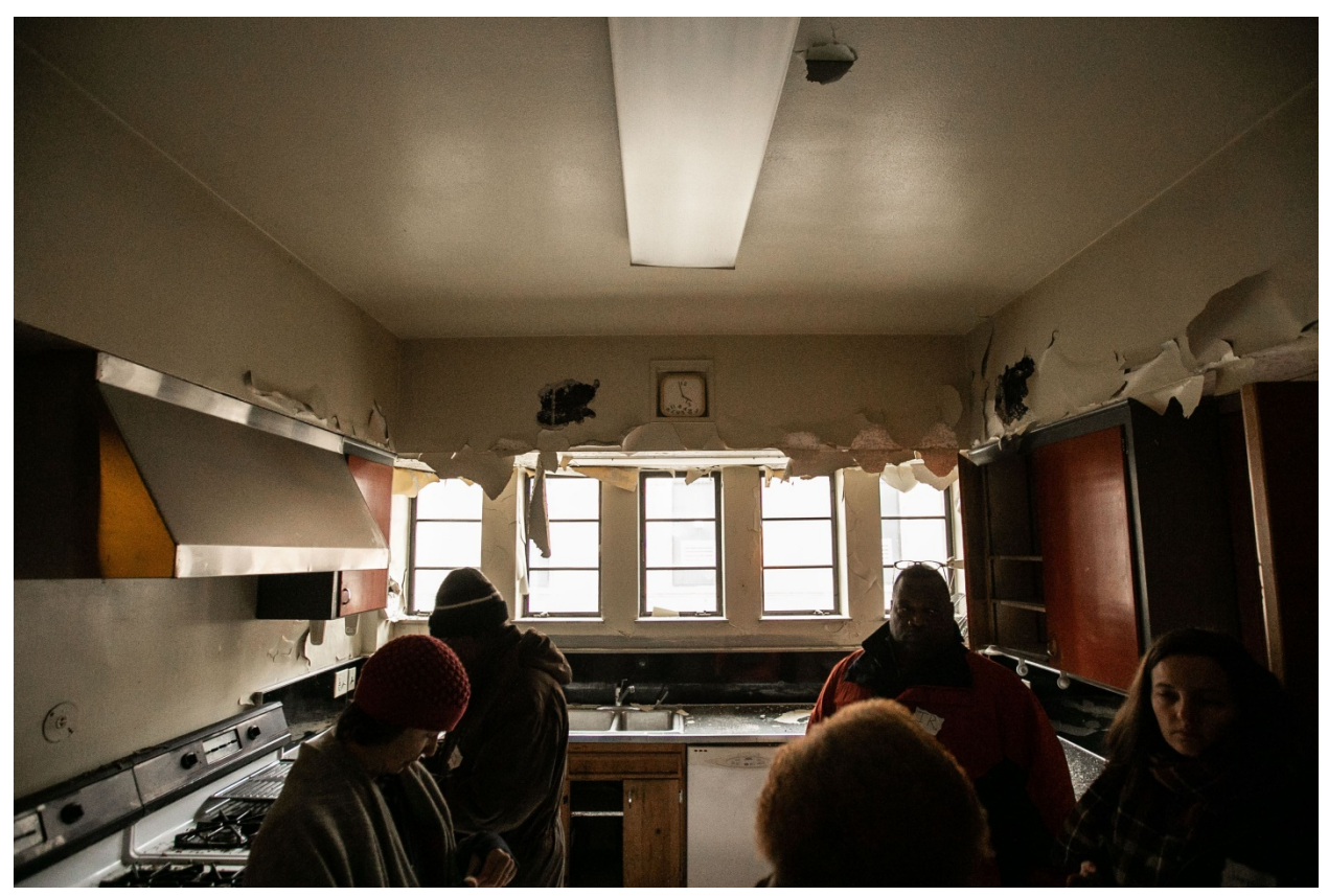
Figure 11 View of former kitchen with wood cabinets and awning windows.