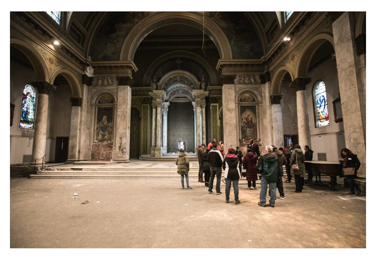
Figure 8 Approaching chancel with baldachin, mosaic dome, pierced marble carvings, and former side altars with mosaics depicting the Virgin Mary and St. Joseph. Encircling the chancel is a mural depicting angels and apostles.