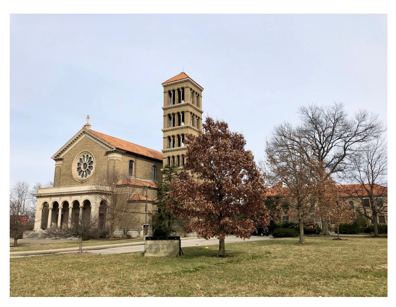
Figure 1 Overall view of St. Mark's Church from Montgomery Road. View to the NE.