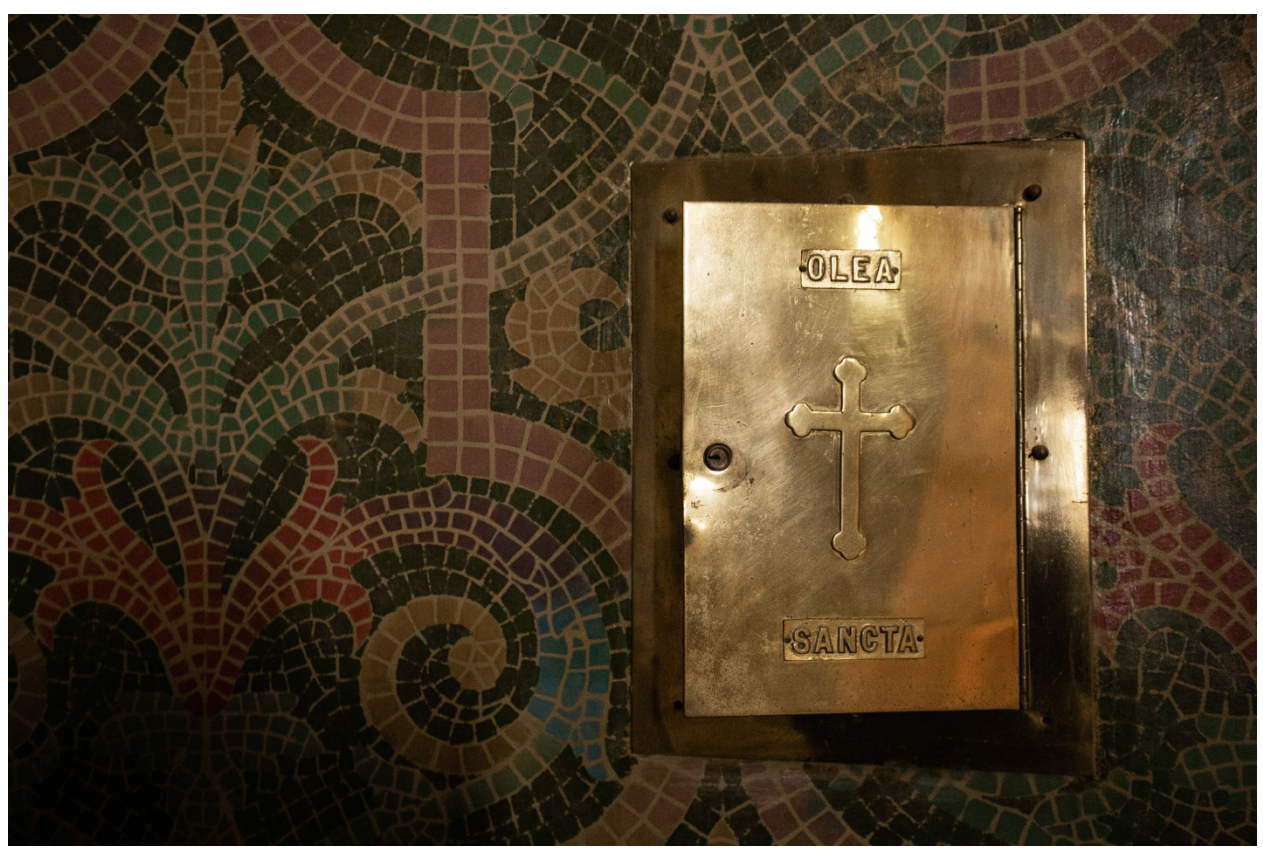
Figure 9 Detail view of mosaic wall treatment and brass cabinet for storage of holy oil.