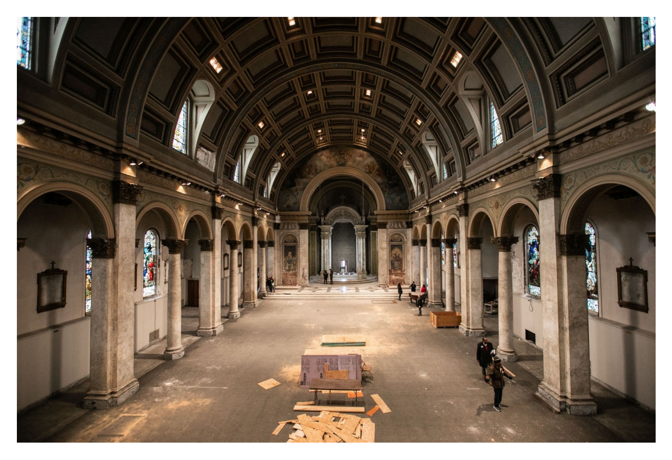
Figure 7 View of interior of church from choir loft, depicting arcaded side aisles and barrel-vaulted, coffered ceiling.