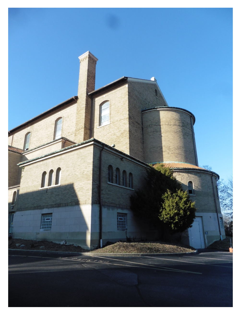
Figure 5 Partial view of rear facade, with semicircular apse, and south elevation. View to the NW.