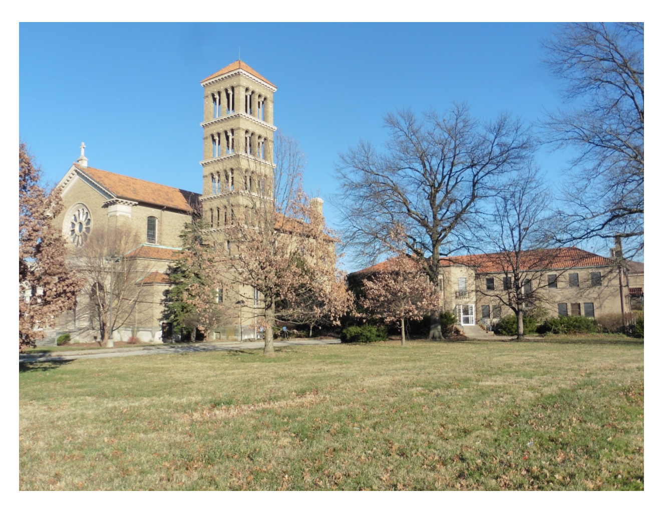
Figure 2 Overall view of St. Mark from Montgomery Road. View to the NE.