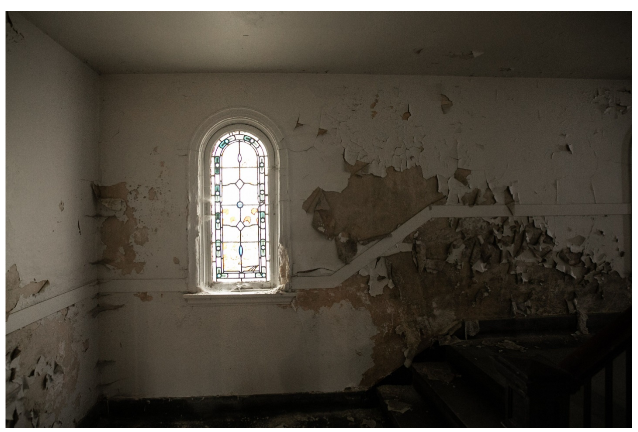
Figure 10 View of stair hall with arched, leaded glass window. Walls exhibit paint failure and plaster damage.