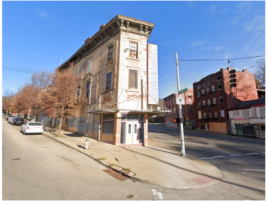
2001 Vine Street