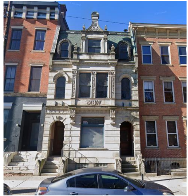
1209 Elm Street