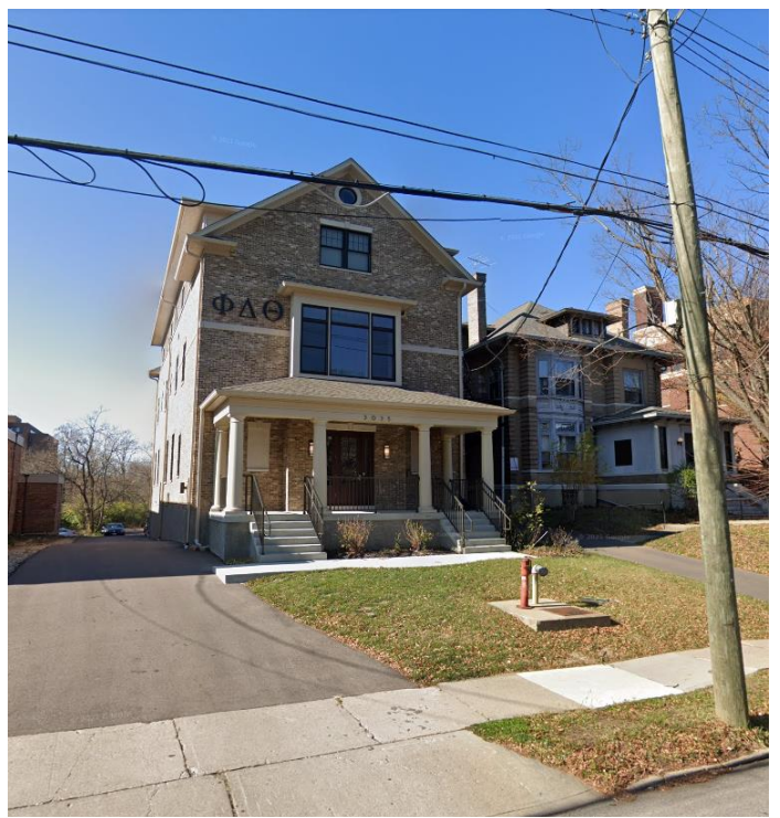
3035 Clifton Avenue