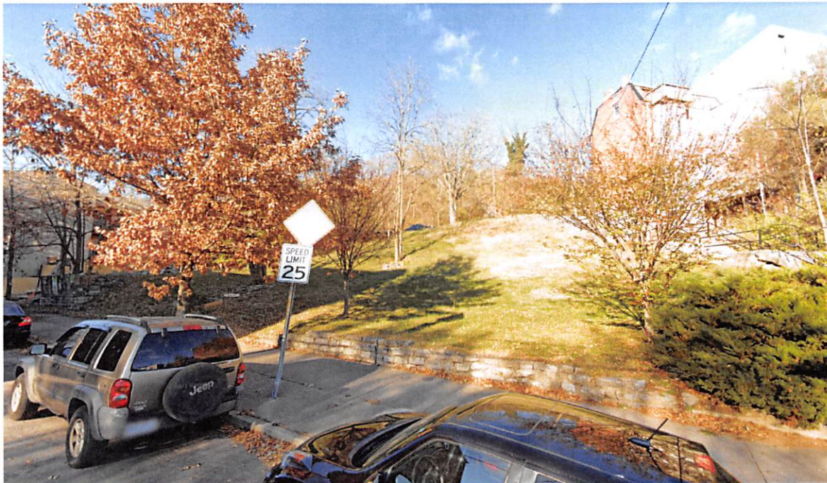
218 Mulberry Street