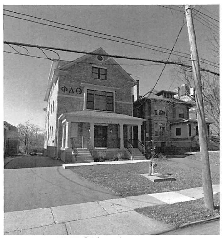
3035 Clifton Avenue