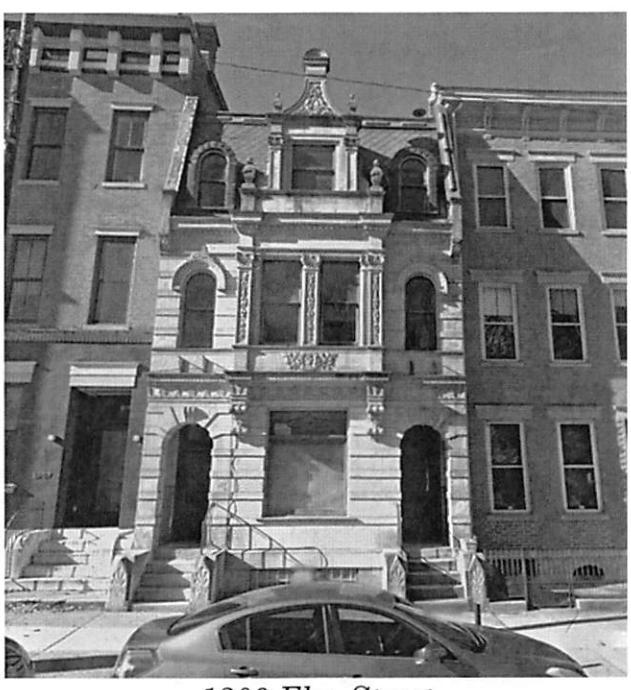
1209 Elm Street