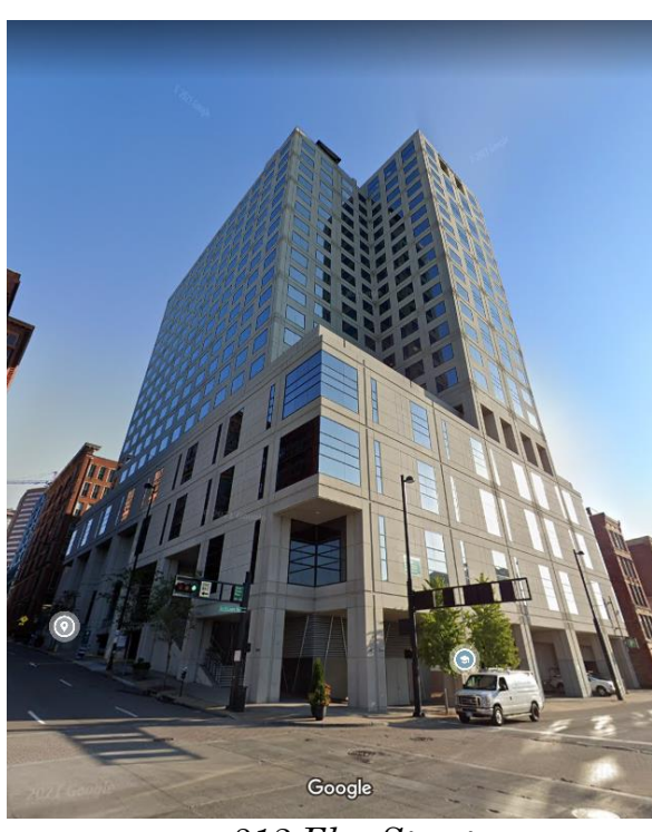
312 Elm Street