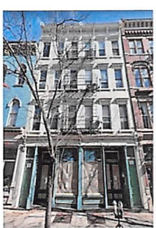
1338 & 1401 Main Street